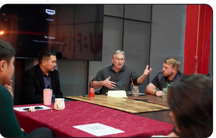
Dad and I presesnting a plan for ministry in Mongolia

Most recently, on December 26th, I flew to San Pedro Sula, Honduras, to attend Teen Missions' Honduras Boot Camp. My assignment and goal for the trip was to learn from our Honduras