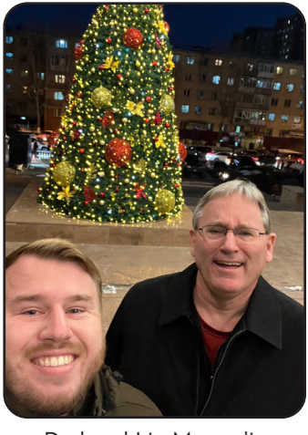
Dad and I in Mongolia

Mongolia, with my dad for a setup trip for a TMI summer team. We went from the 70s of sunny Florida to the -7 of Mongolia. Dad and I spent around five days in Ulaanbaatar meeting with pastors, ministry leaders, and former team members when TMI was in Mongolia in past