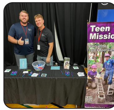
TMI promotions opportunity in Oregon

Since my last update back in August, I have been traveling a good amount for promotions along with setup assignments for upcoming Teen Missions Intl (TMI) teams for the summer. In October I started out by doing some promotions for TMI in the beautiful Rocky Mountains of Colorado. My girlfriend's parents were gracious enough to host me for a couple of days in Colorado Springs before I moved over to Arvada where I stayed with one of the pastors from one of my sending churches at Redeemer Temple. The host homes were such a joy as I could rest in between gigs, but also have such uplifting fellowship during the off times with fellow believers.