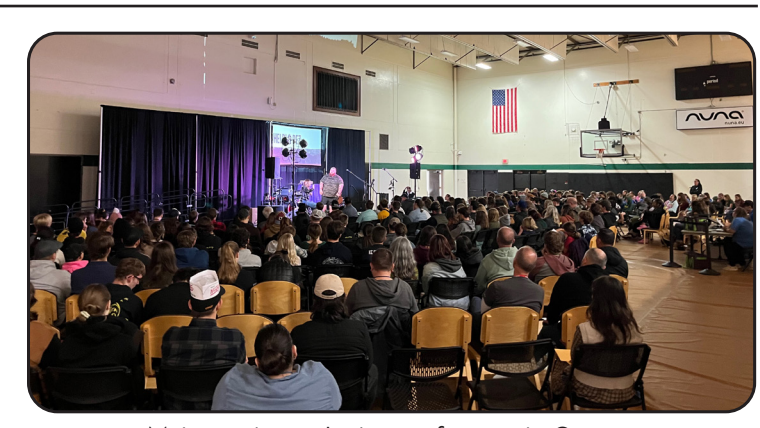
Main session at Ignite conference in Oregon

Since my last update back in August, I have been traveling a good amount for promotions along with setup assignments for upcoming Teen Missions Intl (TMI) teams for the summer. In October I started out by doing some promotions for TMI in the beautiful Rocky Mountains of Colorado. My girlfriend's parents were gracious enough to host me for a couple of days in Colorado Springs before I moved over to Arvada where I stayed with one of the pastors from one of my sending churches at Redeemer Temple. The host homes were such a joy as I could rest in between gigs, but also have such uplifting fellowship during the off times with fellow believers.